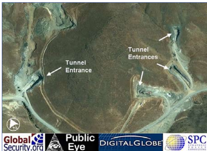
The satellite imagery of Iranian regime's clandestine nuclear site

Paris. Later, in a press conference on 25 September 2009, President Obama confirmed the existence of that site.