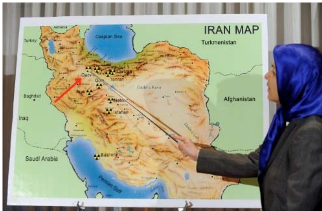
Soona Samsami pointing at the clandestine nuclear site close to Qazvin, west of Tehran

In a press conference at the National Press Club of Washington, DC on September 9, 2010, the Iranian Resistance revealed exclusive details on a major top-secret and strategic nuclear site in the town of Abyek, 120 kilometers west of the Iranian capital, Tehran.