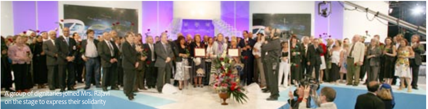
A group of dignitaries joined Mrs. Rajavi on the stage to express their solidarity

On Saturday, June 28, more than 70 thousand Iranians gathered to pledge their support for the Iranian Resistance and its President-elect, Mrs. Maryam Rajavi, in the Paris-Nord Villepinte.