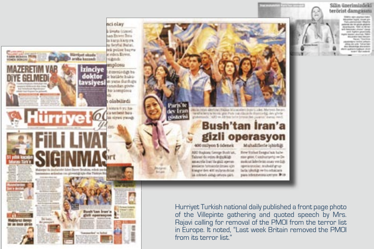
Hurriyet Turkish national daily published a front page photo of the Villepinte gathering and quoted speech by Mrs. Rajavi calling for removal of the PMOI from the terror list in Europe. It noted, "Last week Britain removed the PMOI from its terror list."