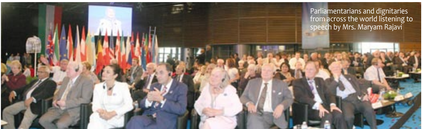
Parliamentarians and dignitaries from across the world listening to speech by Mrs. Maryam Rajavi

I call upon everyone to expand the struggle for the overthrow of the ruling religious fascism.