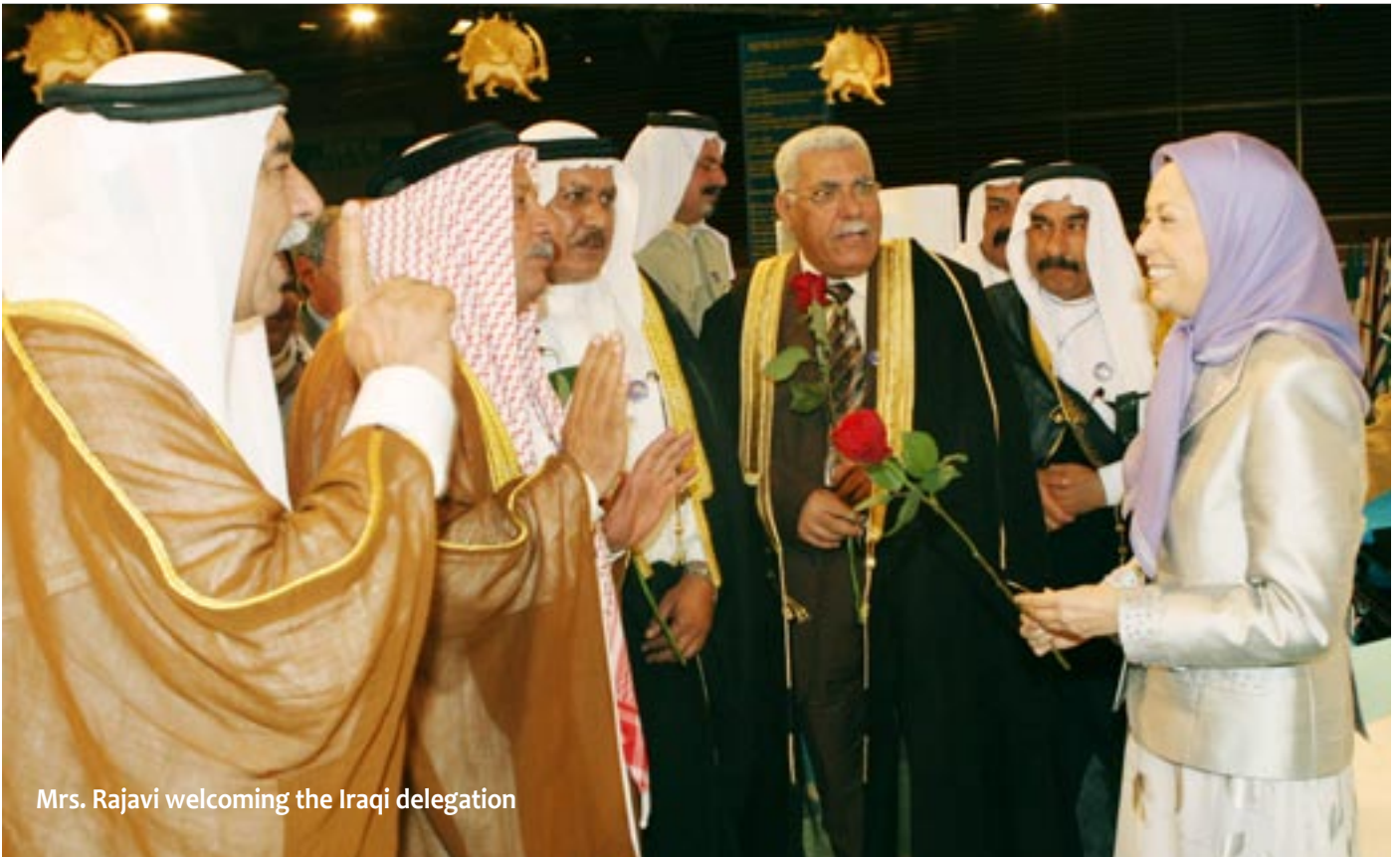
Mrs. Rajavi welcoming the Iraqi delegation