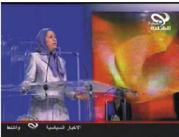
Al-Babeliah Iraqi TV network