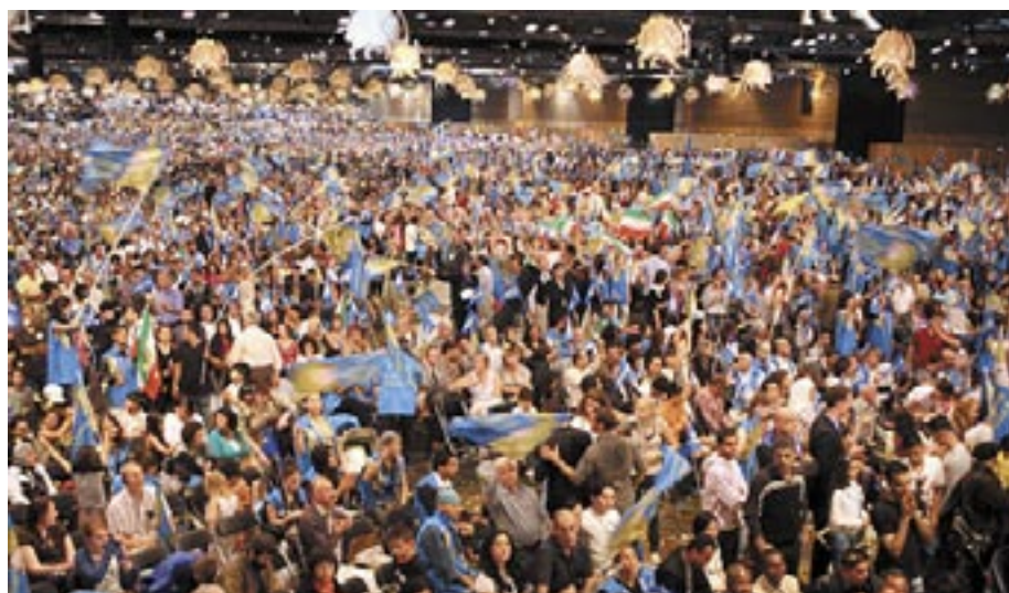
Supporters attended a rally in support of Maryam Rajavi, head of the National Council of Resistance of Iran, and the People's Mujahideen Organisation of Iran near Paris on Saturday.

A leader of the National Council, Maryam Rajavi, said the status of the member group in the United States and the EU was hindering its ability to fight for regime change in Iran.