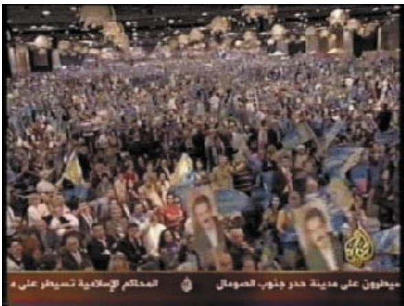
Aljazeera Arab satellite TV network