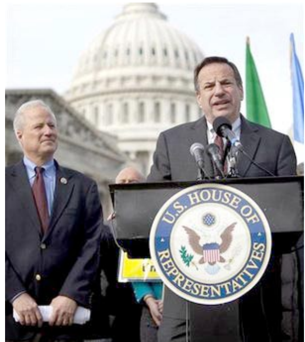
Rep. Mike Coffman, R-Colo., left, listens as Rep. Bob Filner, D-Calif., talks during a news conference on the situation at Camp Ashraf, Iraq, home to 3,400 members of Iranian exiles on Tuesday, Dec. 15, 2009, in Washington.

I appeal to the government of Iraq to respect the human rights of those in Camp Ashraf that they are political refugees and that forcibly evicting them from Camp Ashraf, I believe would cause them great harm. Iraq is a sovereign state but by forcibly evicting those in Camp Ashraf, it is subordinating itself to the will of Iran and not to being a sovereign state of its own. I think it's important that it respects the rights of residents of Camp Ashraf as political refugees and that moving them would clearly harm them a great deal.