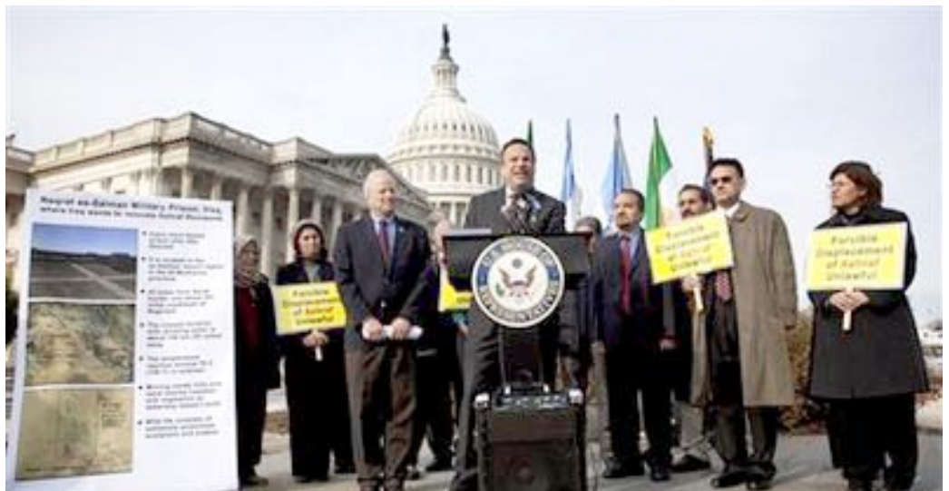
Rep. Mike Coffman, R-Colo., left, listens as Rep. Bob Filner, D-Calif., talks during a news conference on the situation at Camp Ashraf, Iraq, home to 3,400 members of Iranian exiles on Tuesday, Dec. 15, 2009, in Capitol Hill, Washington.