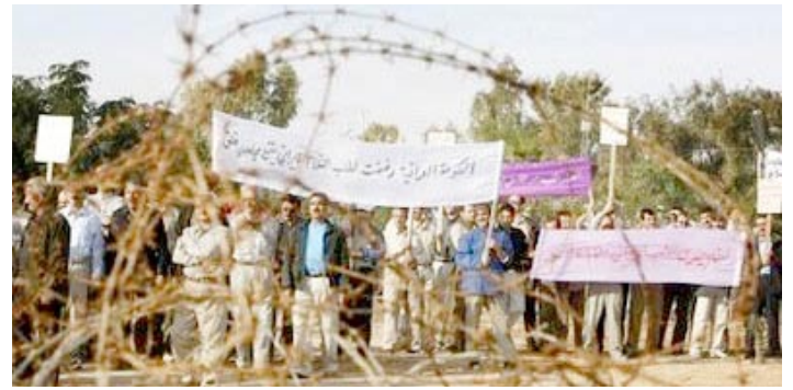
Members of the Iranian opposition group People's Mujahedeen, and their relatives demonstrate against a decision to move them at Camp Ashraf

On the other hand, following their meeting with PMOI representatives, Iraqi forces flooded the streets and various locations of Ashraf in