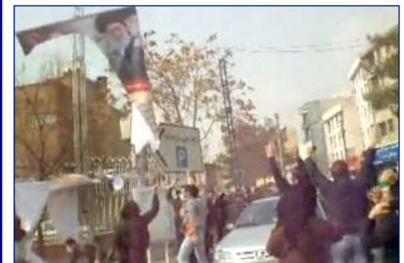
(Amateur video frame grabs)