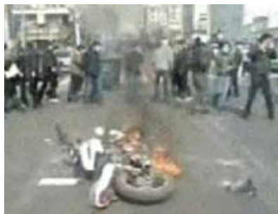
Bassiji's motorcycle set on fire in Tehran's Mossadeq Square

Protestors confronted anti-riot forces in various parts of Tehran. There were intense clashes between youths and suppressive forces. The paramilitary Bassij Force, knife-wielders, and hooligans and thugs used blades and knives to attack people who chanted anti-regime slogans. Youths clashed with Bassij agents and the State Security Forces (SSF).