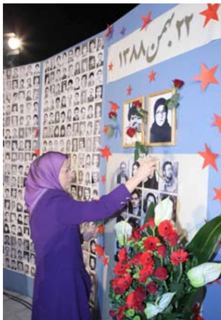
Rajavi pays homage to those fallen in the uprising

On Thursday evening, February 11, a large number of Iranians gathered at the residence of Mrs. Maryam Rajavi in Auvers-sur-Oise to commemorate the anniversary of the anti-monarchical Iranian revolution in 1979. Mrs. Rajavi said in her remarks at the event: Today, the Iranian people made a powerful declaration that the clerical regime must be overthrown. The mullahs' President Mahmoud Ahmadinejad had claimed that February 11th would see the funeral of "the