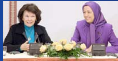
Danielle Mitterrand meets Maryam Rajavi