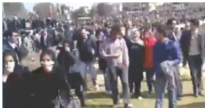
Large crowd gathering at riverbank near Esfahan's historic Siyo-se-pol bridge

In Esfahan , there were demonstrations and clashes during most of Thursday, February 11, in different parts of the city. People were chanting "Down with dictator" and "down with Khamenei." A large number of people were arrested.