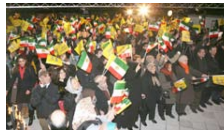
Iranians mark anniversary of Iranian Revolution

On the brink of February 11th, the regime's defeated factions called for "unyielding implementation of the constitution" of the velayat-e faqih system. But, today's uprising gave them an answer that the people