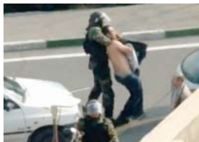
Amateur video grab of brutal beating of protester

An assortment of intelligence, military, Bassij and plainclothes agents, just about a meter apart from one another, were deployed in all of the streets surrounding Azadi Square up to Enghelab Street and Arya Shahr district. About 500 protestors, many of them women and young girls, were arrested at Arya Shahr and nearby areas.