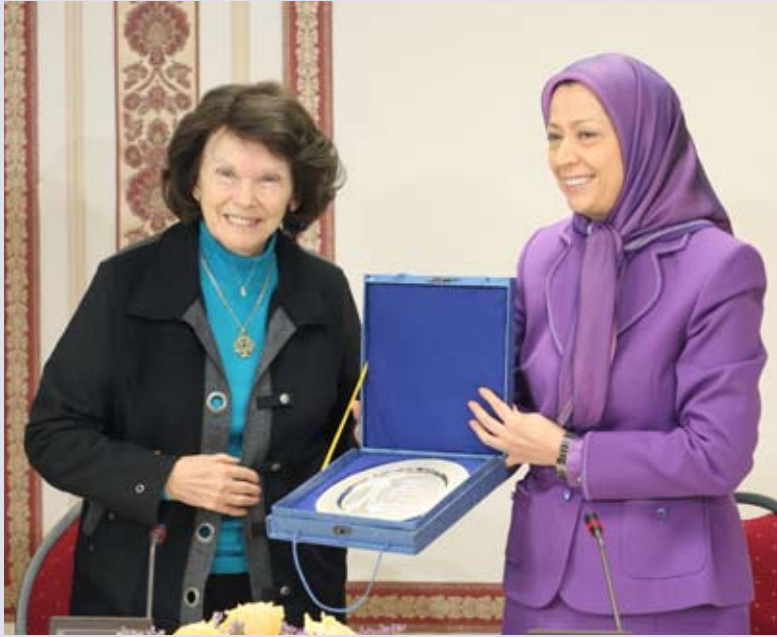
Auvers-sur-Oise, France, February 2, 2010 - Mrs. Rajavi presenting a gift, symbolizing Ashraf, to Mrs. Mitterrand

France's former First Lady during the presidency of Françoise Mitterrand and the Chair of France Liberte Foundation, Danielle Mitterrand, met on February 2, 2010, with the President-elect of the Iranian Resistance, Mrs. Maryam Rajavi.