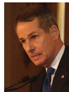
General Peter Pace Chairman of the Joint Chiefs of Staff from 2005 until 2007

The overriding reason to be here this morning for each of us is our passionate desire to see the Iranian people live their lives the way they want to in freedom.