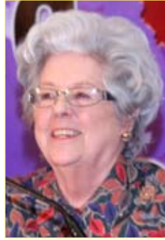
Rt. Hon. Baroness Boothroyd

It is time that the US ends disregard for its commitments towards Ashraf and resumes its protection according to international law. It is time that the US removes the terror label from the PMOI and no longer hinders change in Iran, and for the UN to set up a permanent monitoring team in Ashraf.