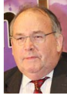
Rt Hon Lord Fraser of Carmyllie QC Former Lord Advocate for Scotland

When you look at the PMOI, they were put on the terrorist list, and had quite a struggle in this country from my fellow Parliamentarians and other people to get them off that list. I can't understand that in a country like America they still keep them on that list. So I will say to the Americans you are champions of human rights, but if you don't do something, you are morally bankrupt. I think when you look at Ashraf residents, they have suffered quite a lot, and people will say, "What can we do? It is a sovereign state. We can't interfere." I don't think that is strictly true, because countries like Iraq, Tunisia and Egypt, they survive on foreign aid from other countries. That is a good tool to make sure they toe the line. We have spent so many lives of our troops to give that people that freedom from Hussein. But can you see any difference? It is still the same. I think it is time that people who powered all of this money, they should realize where that money goes. I always call it a subtle bribery to people in these countries. The President in Iran should learn his lessons from his fellow presidents, that is from Tunisia, from Egypt and the other countries are rising up against dictatorships as well. He should learn his lesson and learn it soon.