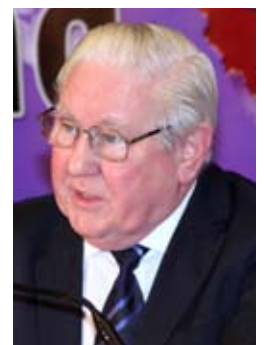
Lord Clarke of Hampstead Former Chairman of the Labour Party