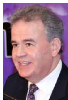
Julian Lewis MP

The demand that the Iranian regime has always made of the West during negotiations over its nuclear ambitions has been that the PMOI be blacklisted as a terrorist organisation. Sadly, in a vain attempt to appease Tehran's tyrants, a number of countries blacklisted the PMOI. The PMOI has taken its battle for recognition as a legitimate opposition group through the British, European and now the US courts.