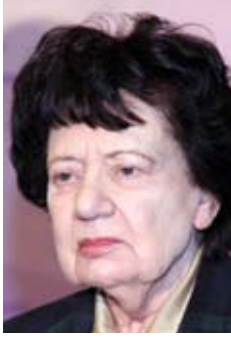
Baroness Turner of Camden former Deputy Speaker of the House of Lords