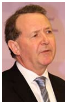
Lord Alton of Liverpool independent crossbench life Peer

we must learn swift lessons from the storms swirling around the Middle East. Both our countries for too long have let Iran's mullahs shape our policies towards them and to the resistance which offers a replacement secular state, respecting human rights and democracy and halts nuclear weapons development. The challenge for us and the rest of the European Union is to make clear that we stand on the side of those millions in Iran who cry freedom and want change now. This means that the US should follow our lead in removing the PMOI, the main partner in the coalition resistance, from the list of organisations concerned with terrorism. That label was only attached here as the price the mullahs demanded for the opening of talks with them about their nuclear weapons program.