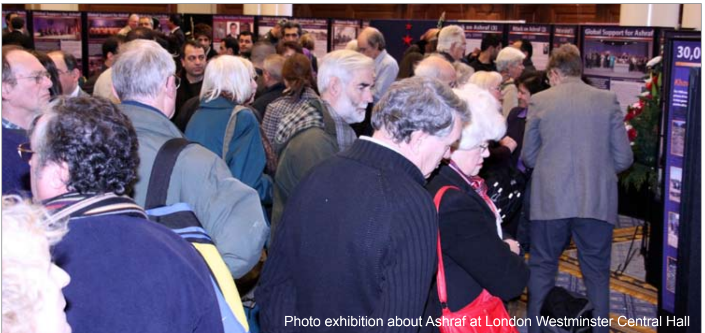
Photo exhibition about Ashraf at London Westminster Central Hall

"I must also tell you that the last debate we had in the House of Lords on Iran and Iraq, the government minister gave an undertaking that he would try to facilitate a visit by an all party group of MPs and peers to Camp Ashraf. We wait to see the response of the Iraqi government to that given that they keep on chorusing about their belief in free speech and the right of human rights and respect for human rights. We want to go there and see for ourselves what is happening in Ashraf, and we will judge them by their response. So Salaam Ashraf, we are on our way."