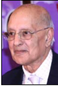
Lord King of West Bromwich

I have always been very interested in women's rights, and it has always seemed to me appalling that the Iranian government applies its oppression in particular to woman. You see appalling pictures of the kind of brutality inflicted upon the female population. Madam Rajavi has an agenda of equality, and that makes me very, very supportive of everything that she has been doing. What has most concerned the members of my committee, including myself, is the treatment of the colleagues, and I call them colleagues, and friends in the Ashraf camp. It really is quite appalling. We have raised this on several occasions in Parliament under your chairmanship, Mr Chairman, and we have had a number of varying sorts of replies from our government. A situation in which these people who include woman and children have been psychologically abused by these 180 loudspeakers, this awful noise ... in addition to that there has been persecution. We have to salute the courage of people in Iran who are opposing the current government and continue to do so. It takes enormous courage to oppose the government that occupies an undemocratic situation, and in which it also constantly applies brutal processes to keep people quiet. It won't remain quiet.