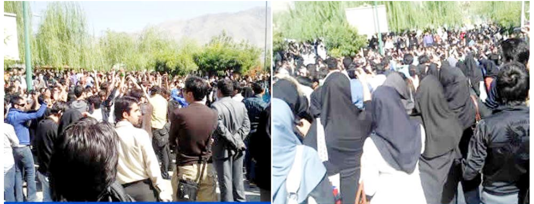
Karaj, October 20, 2009

On Tuesday, October 20, close to 1,000 students at the technical college of the Open University of Tehran (central branch) staged protests against the Iranian regime, chanting "Death to dictator" and "Students will die but will not be humiliated." The protest marked the fourth such move by students at this university since the start of the new school year.