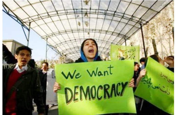
Iranian students shout slogans during a 2008 protest at Tehran University. Iranian authorities warned opposition supporters against holding any protests when university students mark the annual Students Day on December 7.

The Telecommunication Company has also sent out a directive to all