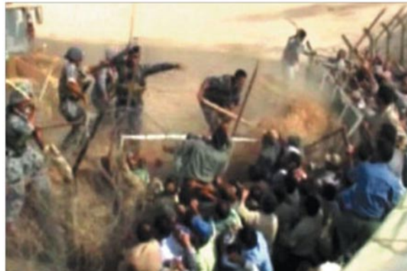
Fotograma del vídeo del ataque, incorporado a las actuaciones que se siguen en la Audiencia Nacional.

El magistrado ha dirigido una comisión rogatoria a las autoridades judiciales de Irak para que le informen de si existe algún procedimiento abierto sobre estos hechos. En caso contrario, perseguirá al presunto responsable, ya que los Convenios de Ginebra obligan a los Estados parte a perseguir esos crímenes.